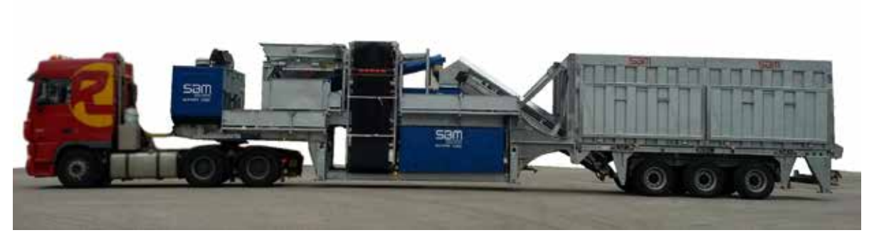
Road-transport capable EUROMIX 400 SM C inline plant for recycling concrete

Extreme operating and environmental conditions, high availability and optimal plant use impose high demands on the drive systems. The geared motors must be protected against humidity as well as extreme dust loading. Along with robustness, reliability is especially crucial for job-site operation. Particularly for motorway or tunnel construction, a continuous supply of concrete is essential. The compact design and high mobility of the EUROMIX 400C also requires low-profile gear units with flexible mounting options.